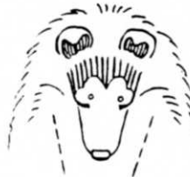
Too much wedge. Wider backskull.