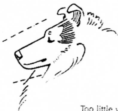
Too little wedge. Terrier-like profile.