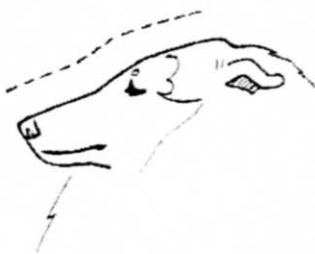
No Stop. Fill between eyes. Prominent occiput. "Throaty" (broken throat line).