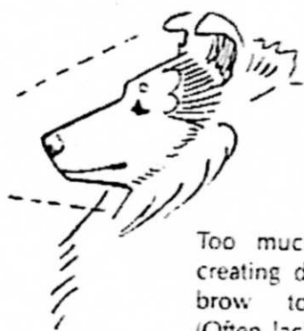
Too much wedge, creating depth from brow to throat. (Often lacking finish to underjaw).