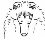
Total absence of wedge. Two-piece head.