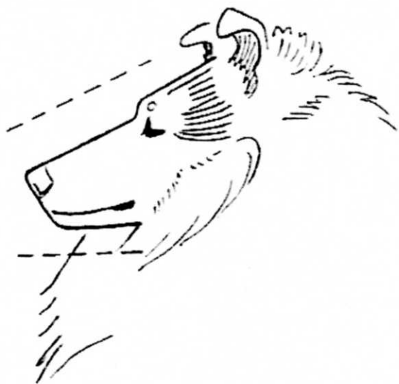
Correct wedge in profile.