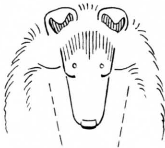
Correct wedge from above.