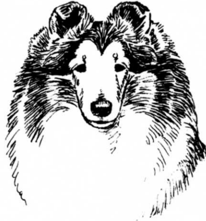
Correct Head: Front View