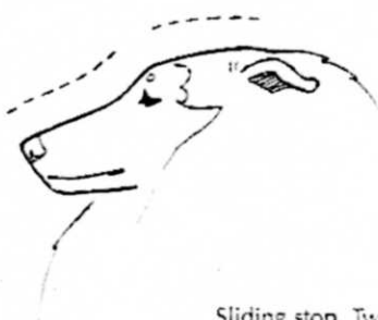
Sliding stop. Two-angled (receding backskull). Drop-off at nose.