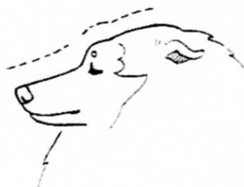
High over eyes, rounded skull, slight "dish" to top of muzzle. "Sharkey"—pointed end to wedge. Lips do not meet properly.